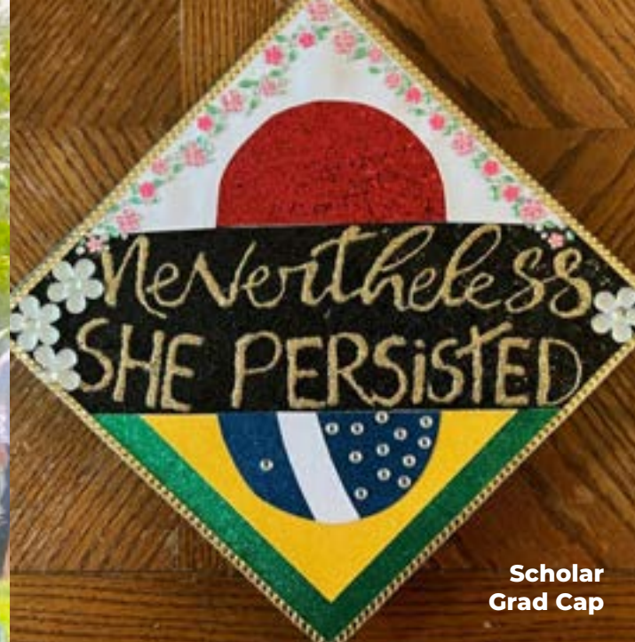
Scholar Grad Cap