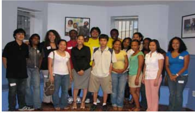
Spring 2010 Scholarship Award Recipients