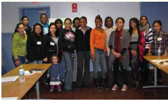
Fall 2010 Scholarship Award Recipients